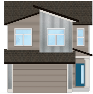
INTERNAL STREET ELEVATION