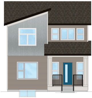
PUBLIC STREET ELEVATION