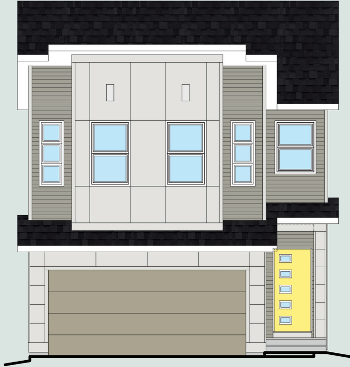
INTERNAL STREET ELEVATION