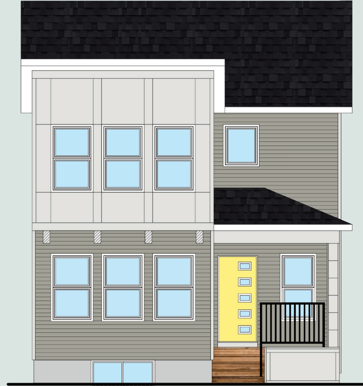
PUBLIC STREET ELEVATION