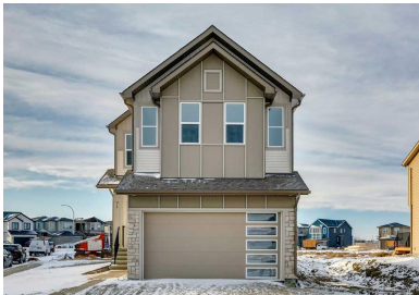
FARMHOUSE #1 ELEVATION

Edited: January 17, 2024 The builder reserves the right to modify or change plans, specifications, features and prices without notice. Materials may be substituted with equivalent or better at the builder's sole discretion. All dimensions and sizes are approximate and are based on architectural measurements. As reverse, mirrored and/or flipped plans occur throughout the building, please see architectural plans if material to your decision to purchase. Renderings, furnishings and equipment shown are an artist's conception and are intended as a general reference only. Please see disclosure statement for specific offering details. E. & O.E.