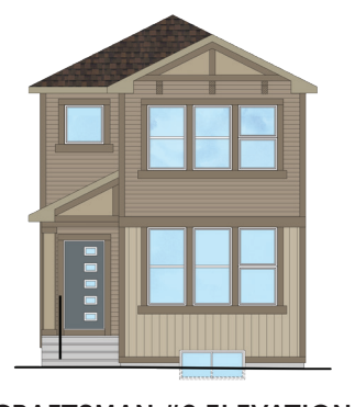
CRAFTSMAN #2 ELEVATION

The builder reserves the right to modify or change plans, specifications, features and prices without notice. Materials may be substituted with equivalent or better at the builder's sole discretion. All dimensions and sizes are approximate and are based on architectural measurements. As reverse, mirrored and/or flipped plans occur throughout the building, please see architectural plans if material to your decision to purchase. Renderings, furnishings and equipment shown are an artist's conception and are intended as a general reference only. Please see disclosure statement for specific offering details. E. & O.E.